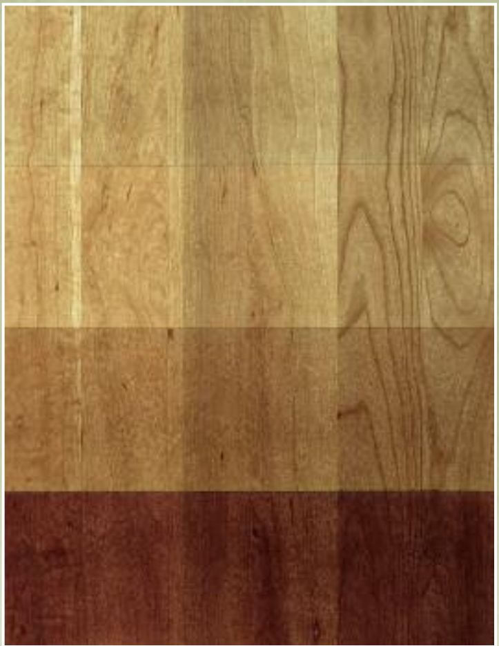
Four different stain colors are used to demonstrate the way Cherry will darken over time. Samples at left are original stain colors, the center column has begun to age, and the far right column has mellowed and taken on Cherry's distinctive patina.